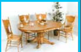
TABLE & 6 CHAIRS $995